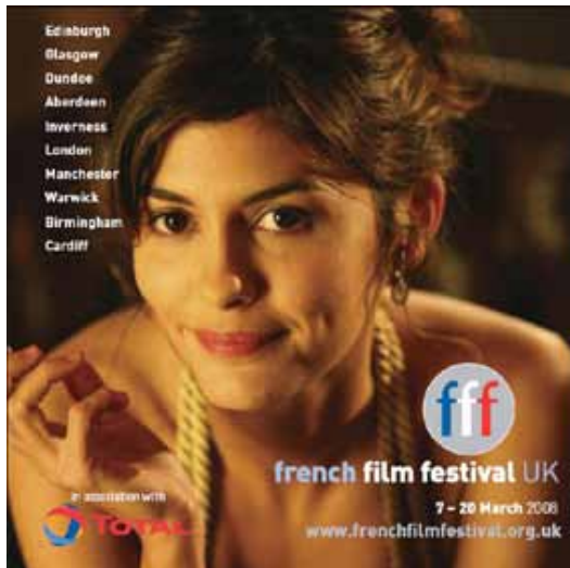
Festival Brochure 2008